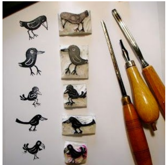
Prints, stamps and chisels