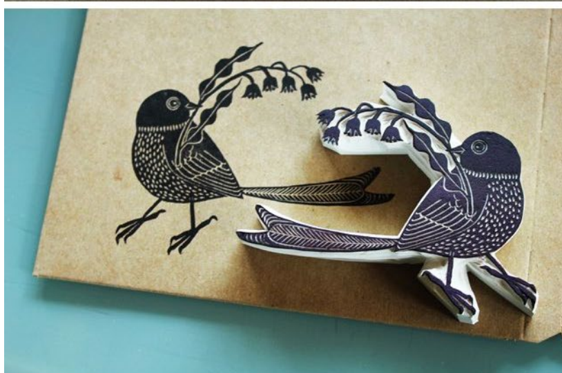
What the step by step process looks like