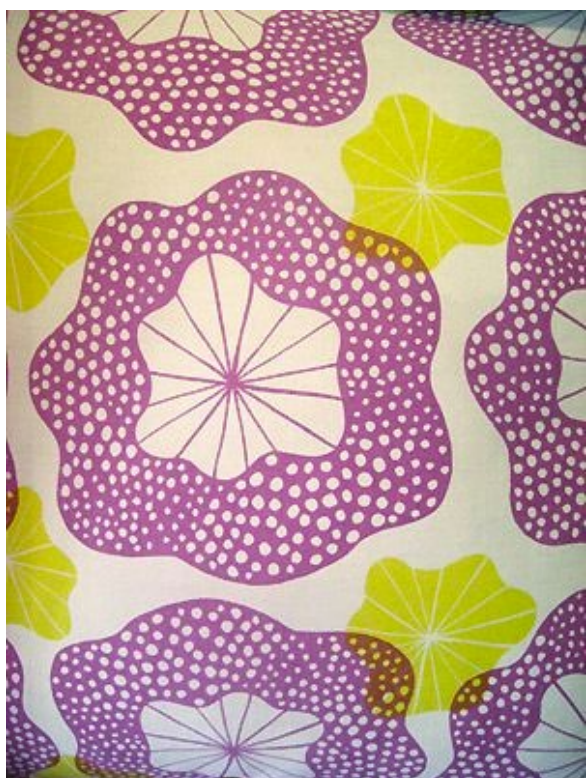
Textile made with carved stamps